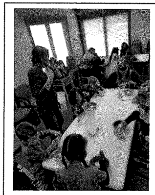
Dinotober with PBS Montana

Use: 125/day, October average PC: 9 Wi-Fi 17/day, October average Cr use: 260, month total Programming attendance, October: 190